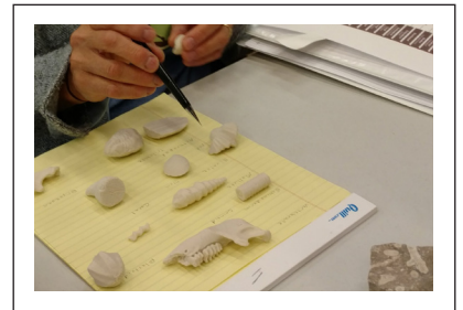
Figure 2: Identifying fossils using 3-D prints.