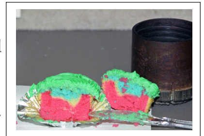
Figure 3: Cupcake interior

If most of Indiana's bedrock is covered with unconsolidated sediment, how do geologists determine what is below the surface?