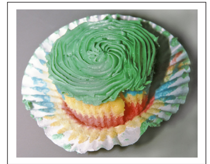
Figure 1: Colored layers of a cupcake for student activity