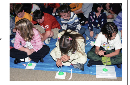
Figure 2: Students modeling geologic drilling with layered cupcakes